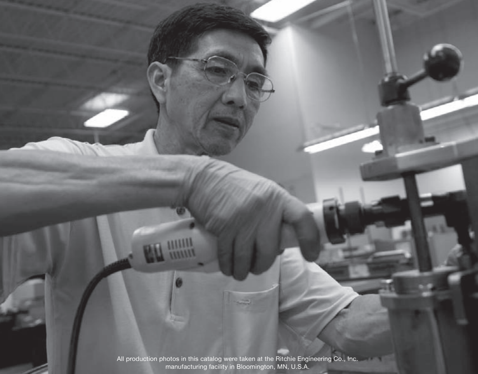
All production photos in this catalog were taken at the Ritchie Engineering Co., Inc. manufacturing facility in Bloomington, MN, U.S.A.

For over 60 years, the YELLOW JACKET® name has been synonymous with craftsmanship and reliability. Ritchie Engineering is proud of this legacy and continues to provide not only the tools to get the job done, but the confidence to know it will get done right.